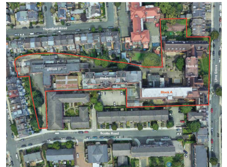
Site boundary (UAL)