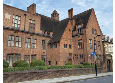
External view of 40 Lime Grove

The new UAL School of Pre-Degree Studies will provide preparatory courses which help bridge the gap between secondary school and degree-level study. It will help nurture the next generation of creators and innovators from London and across the world at the very start of their careers.